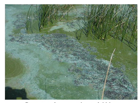
Decomposing cyanobacterial bloom

Sand and rocks along the shore may be coated with what looks like bright bluegreen paint. Blooms decompose and odors intensify, often reminiscent of raw sewage. Rapid decomposition may deplete the water of oxygen and can produce high concentrations of ammonia that can kill fish and other aquatic animals.