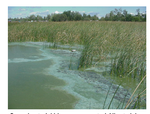
Cyanobacterial bloom on a central Alberta lake

Blooms are most common in lakes from early July to mid-September. Timing, intensity and duration will vary from year to year because of nutrient availability, air and water temperatures, sunlight and wind velocity. Blooms can occur during winter under ice, but this is rare.