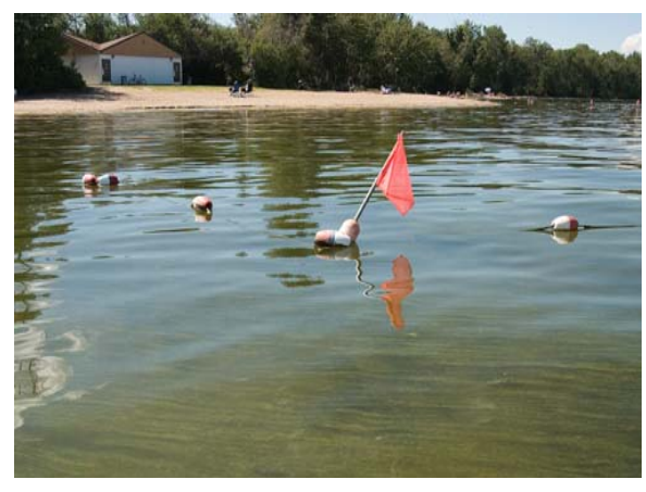
Cyanobacterial bloom at public beach, Pigeon Lake AB